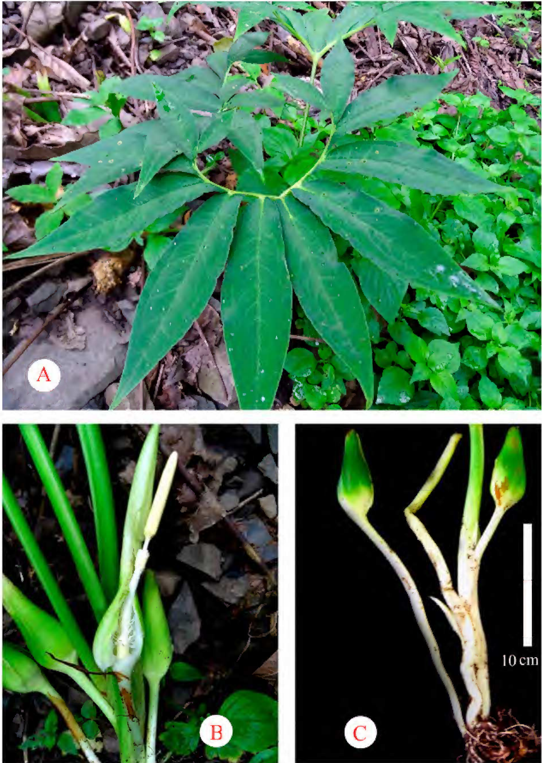
Plate 1. Sauromatum horsfieldii Miq.: A. Plant in situ ; B. Inflorescences; C. Lower half of Plant.